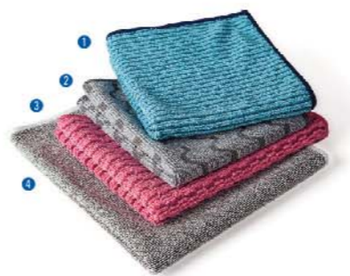
TCK-C5501 75% Polyester, 10% Nylon 15% Polyester/Charcoal 350(g/sm) 30X30(cm)