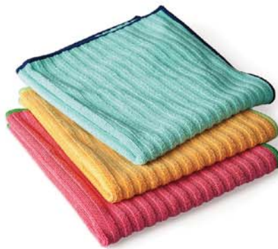
TCK-C5001 80% Polyester, 20% Nylon 320(g/sm) 40X40(cm)