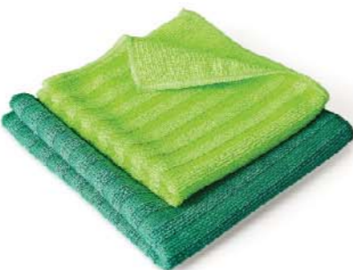
TCK-C4007 90% Polyester, 10% Nylon 310(g/sm) 40X40(cm)