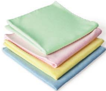
TCK-C6202 80% Polyester, 20% Nylon 200(g/sm) 40X40(cm)