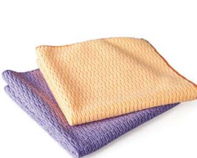
TCK-C5007 80% Polyester, 20% Nylon 280(g/sm) 40X40(cm)