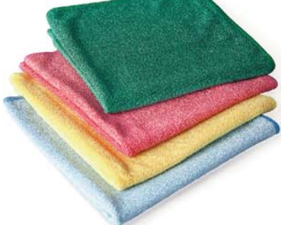
TCK-C3001 80% Polyester, 20% Nylon 320(g/sm) 40X40(cm)