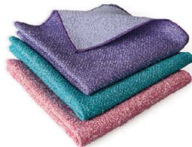
TCK-C4006 90% Polyester, 10% Nylon 280(g/sm) 40X40(cm)