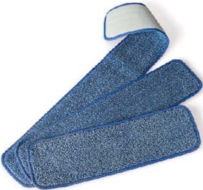
TCK-M1111 50% Microfiber, 50% Polyester 40 ~ 120x14(cm)