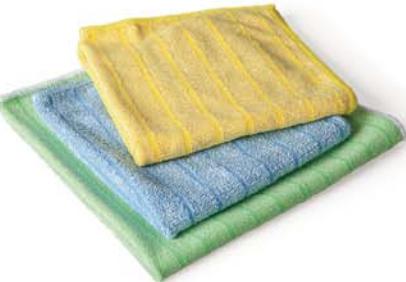
TCK-C3002 80% Polyester 20% Nylon 280(g/sm) 40X40(cm)