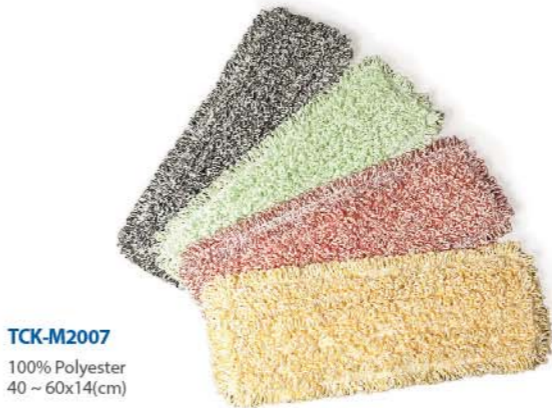
TCK-M2007 100% Polyester 40 ~ 60x14(cm)