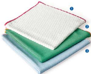
TCK-C6301 80% Polyester, 20% Nylon 295(g/sm) 40X40(cm)