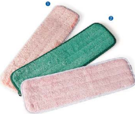
TCK-M1002 ① 100% Microfiber 40 ~ 120x14(cm) TCK-M1003 ② 100% Microfiber 40 ~ 120x14(cm)