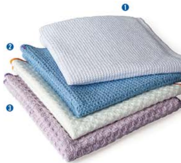
TCK-C5010 ① 80% Polyester, 20% Nylon 310(g/sm) 40X40(cm)