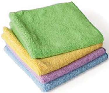
TCK-C2003 80% Polyester, 20% Nylon 330(g/sm) 40X40(cm)