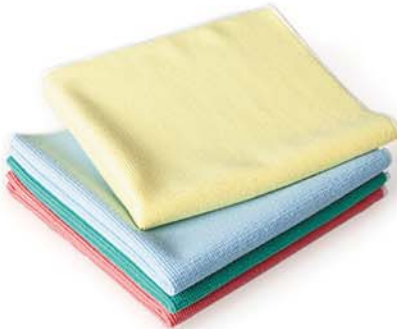
TCK-C1004 80% Polyester, 20% Nylon 320(g/sm) 40X40(cm)