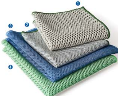
TCK-C5002 ① 80% Polyester, 20% Nylon 600(g/sm) 30X30(cm)