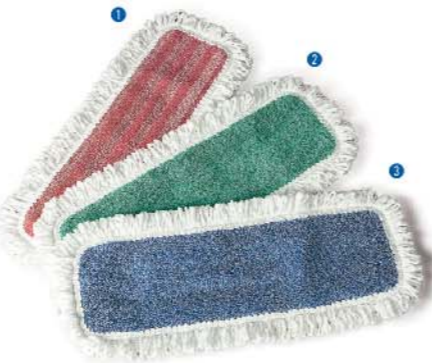
TCK-M1106 ① 50% Microfiber 50% Polyester 40 ~ 120x14(cm) TCK-M1001 ② 100% Microfiber 40 ~ 120x14(cm) TCK-M1107 ③ 50% Microfiber 50% Polyester 40 ~ 120x14(cm)