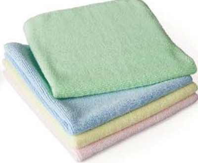
TCK-C2002 80% Polyester, 20% Nylon 260(g/sm) 40X40(cm)