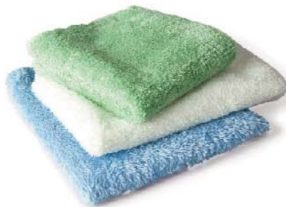
TCK-C5014 80% Polyester, 20% Nylon 320(g/sm) 40X40(cm)