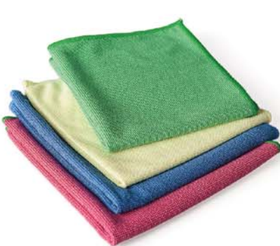
TCK-C3103 80% Polyester, 20% Nylon 280(g/sm) 40X40(cm)