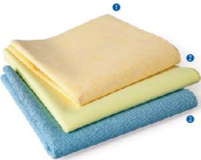
TCK-C6101 35% Polyester, 35% Nylon 30% Polyurethane 360(g/sm) 30X30(cm)