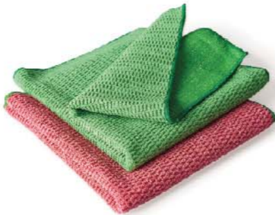
TCK-C4004 90% Polyester, 10% Nylon 290(g/sm) 40X40(cm)