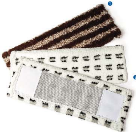
TCK-M2009 ① 65% Polyester, 35% Acrylic 40 ~ 60x14(cm) TCK-M2008 ② 90% Polyester, 10% Nylon 40 ~ 60x14(cm)