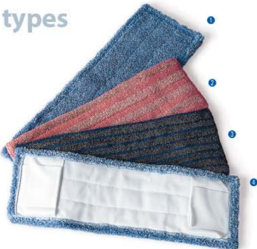
TCK-M2001 ① 50% Microfiber, 50% Polyester 40 ~ 60x14(cm) TCK-M2002 ② 50% Microfiber, 50% Polyester 40 ~ 60x14(cm) TCK-M2003 ③ 60% Microfiber, 20% Polyester 20% polypropylene 40 ~ 60x14(cm) TCK-M2004 ④ 50% Microfiber, 50% Polyester 40 ~ 60x14(cm)