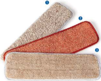
TCK-M1108 ① 50% Microfiber, 50% Polyester 40 ~ 120x14(cm) TCK-M1109 ② 50% Microfiber, 50% Polyester 40 ~ 120x14(cm) TCK-M1110 ③ 50% Microfiber, 50% Polyester 40 ~ 120x14(cm)