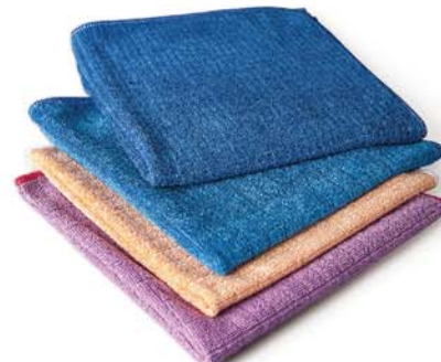
TCK-C3003 80% Polyester, 20% Nylon 280(g/sm) 40X40(cm)