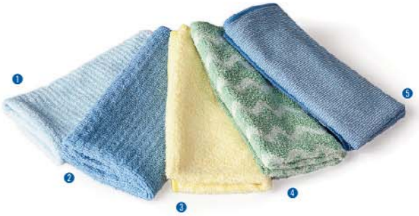
TCK-C5505 78% Polyester, 17% Nylon 5% Kenaf 250(g/sm) 40X40(cm)