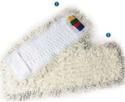
TCK-M2005 ① 65% Polyester, 35% Rayon 40 ~ 60x14(cm) TCK-M2006E ② 65% Polyester, 35% Rayon 40 ~ 60x14(cm)