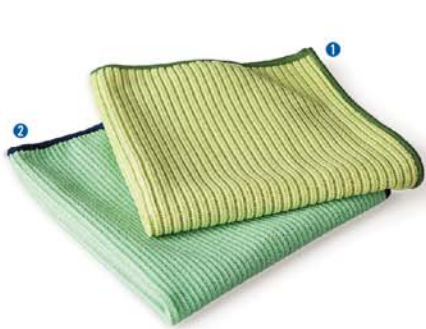
TCK-C1003 ① 80% Polyester, 20% Nylon 280(g/sm) 40X40(cm)