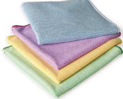
TCK-C3102 80% Polyester, 20% Nylon 290(g/sm) 40X40(cm)