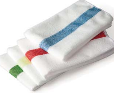
TCK-C2004 100% Polyester 150(g/sm) 30X30(cm)