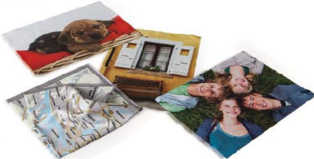
TCK-C6002 80% Polyester, 20% Nylon 200, 250(g/sm) 15x18, 19x19.5(cm)