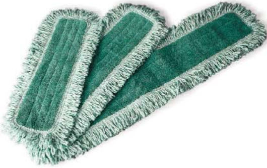
TCK-M1004 100% Microfiber 40 ~ 120x14(cm)