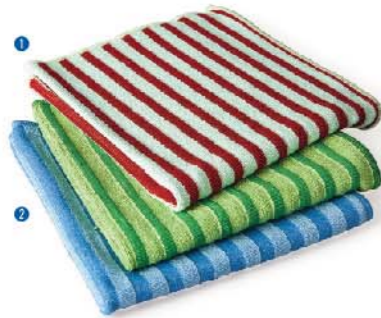
TCK-C4001 65% Polyester, 15% Nylon, 20% Polypropylene 440(g/sm) 40X40(cm)