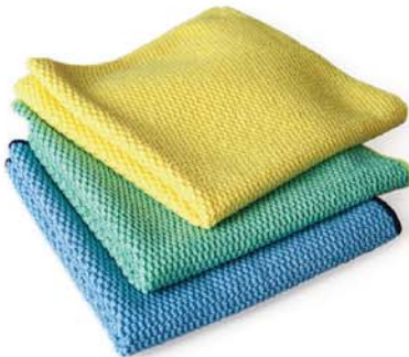
TCK-C5006 80% Polyester, 20% Nylon 280(g/sm) 40X40(cm)