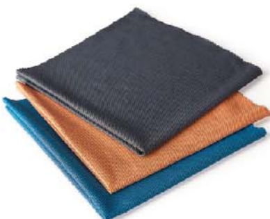
TCK-C6401 80% Polyester, 20% Nylon 195(g/sm) 40X40(cm)