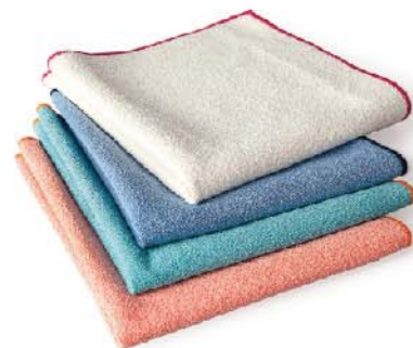
TCK-C5013 80% Polyester, 20% Nylon 330(g/sm) 40X40(cm)